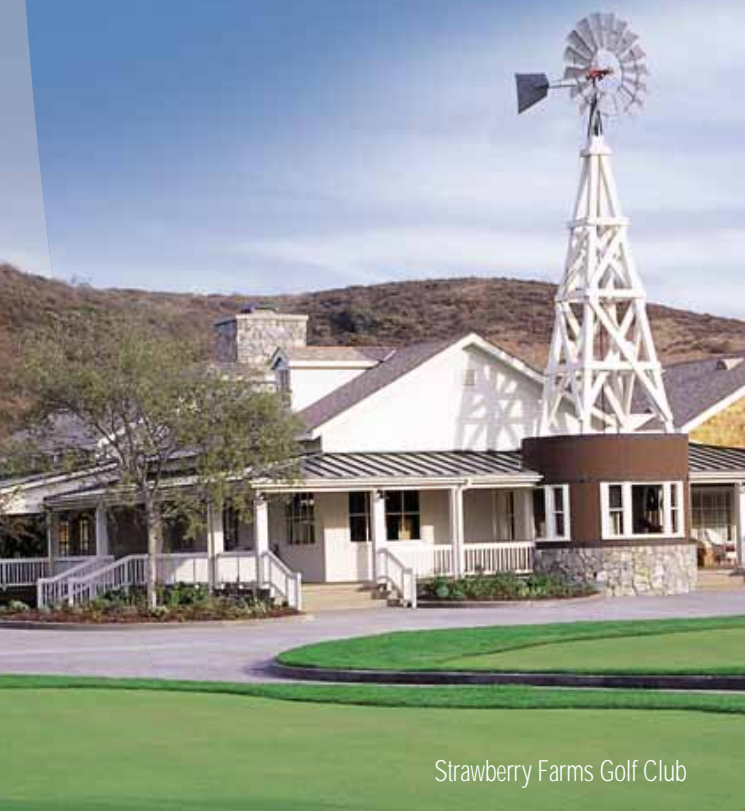
Strawberry Farms Golf Club

The climate in this coastal community couldn't be more invigorating. A perfect combination of temperate weather and beautiful scenery makes Costa Mesa ideal for the perfect round of golf. Finding an award-winning golf course and tee time is easy. Pro-golfers polish their games in the Orange County area where many tournaments are held, including the Toshiba Senior Classic.